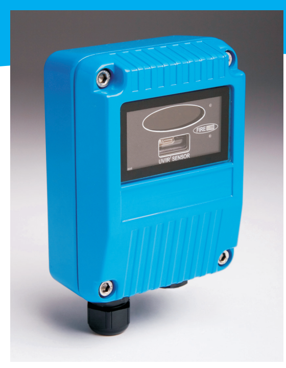
Part Number: 16591-00

Worldwide approvals include EN54:10, with VdS and LPCB certification, as well as SIL 2 rated.Visit www.ffeuk.com for up to date approvals information.